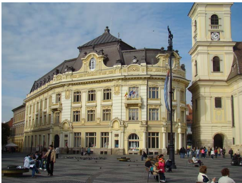
Sibiu – The City Hall

Sibiu is beautiful; it is a delight for the eyes. Even if someone comes to Sibiu for the tenth time, the medieval burgh seems to always have a surprise for the visitor, something that remained unobserved the last time due to the glances "caught" by other beauties: churches, walls, museums, philharmonic, theatres, a good selection of restaurants, pavement cafés and beer gardens.