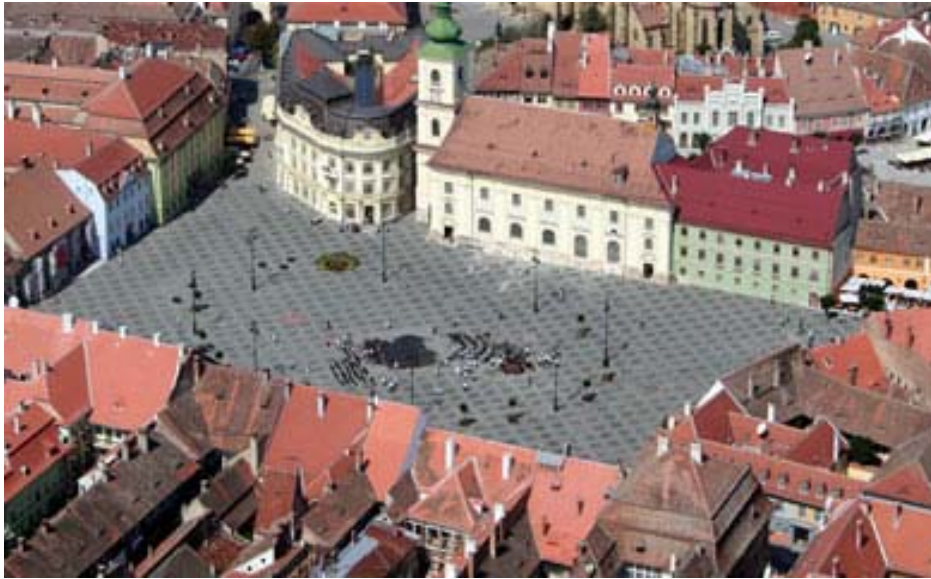
Sibiu – The Large Square

Sibiu city ( Hermannstadt ) is situated in the middle of the country, at the crossing points between the 45^{\circ}47' Northern latitude parallel and the 24^{\circ}05' Eastern longitude meridian, where the roads of the historical Romanian areas meet. It is also a junction for the spreading of material and spiritual values, which created a blossoming culture and civilization.